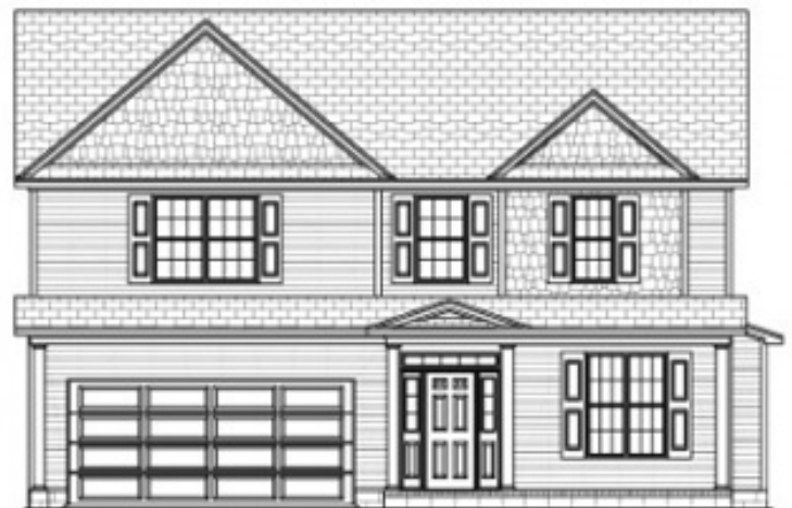
FRONT ELEVATION "C"