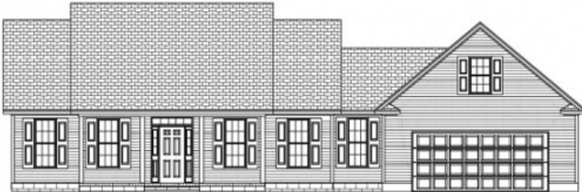
FRONT ELEVATION "A"