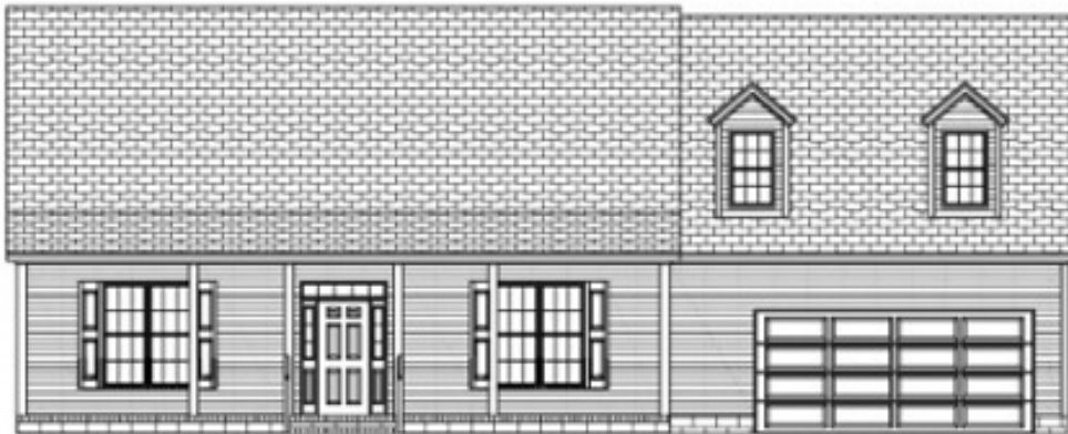
FRONT ELEVATION "A"

OPTIONAL: FIREPLACE, SIDE LITE WINDOWS, SEPARATE TUB & SHOWER, SECOND SINK IN MASTER BATH, BAR IN KITCHEN, TRAY CEILING IN GREAT ROOM, SECOND BONUS RM, DORMERS, LG. GABLE, AND HARDWOOD FLOORS.