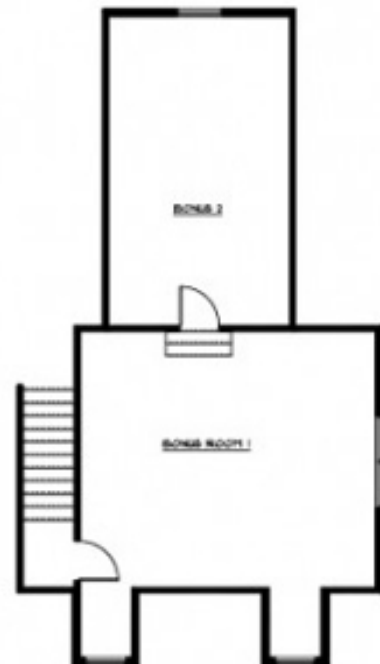
DORMERS ARE OPTIONAL