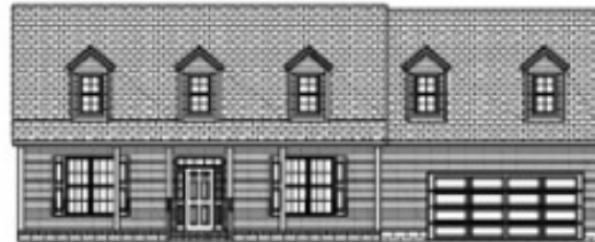
FRONT ELEVATION "C"