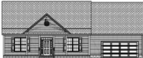
FRONT ELEVATION "B"