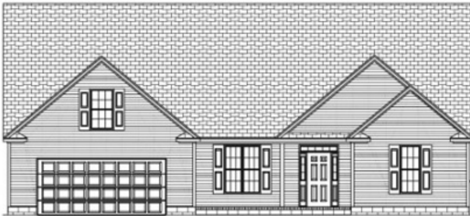
FRONT ELEVATION "A"

OPTIONAL: FIREPLACE, SIDE LITE WINDOWS, BOARD & BATTEN SIDING, BRICK PROFILES, SEPARATE TUB AND SHOWER, SECOND SINK IN MASTER AND HALL BATH, BAR IN KITCHEN, TRAY CEILING IN GREAT ROOM AND MASTER BEDROOM, AND HARDWOOD FLOORS.