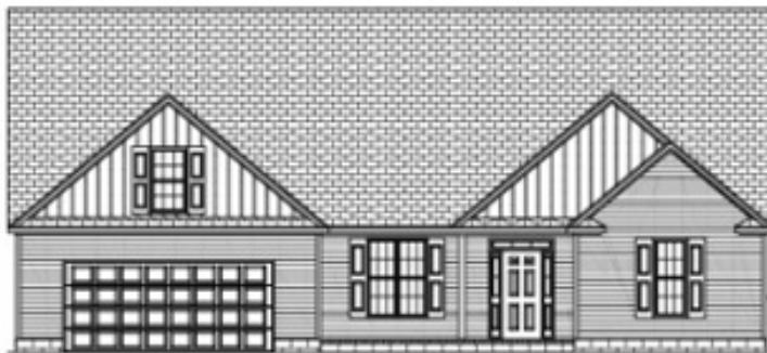
FRONT ELEVATION "B"