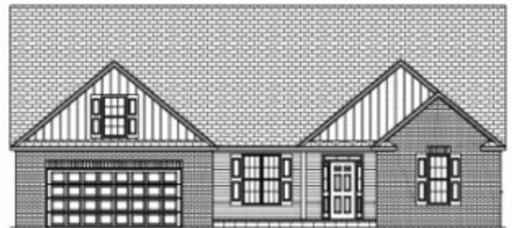
FRONT ELEVATION "B"